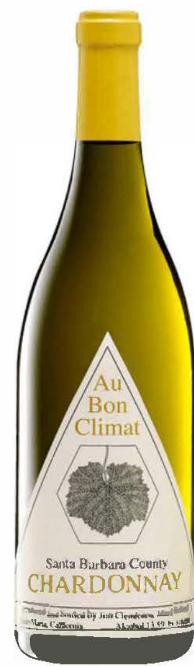
2018 AU BON CLIMAT CHARDONNAY 20/75 SANTA BARBARA COUNTY