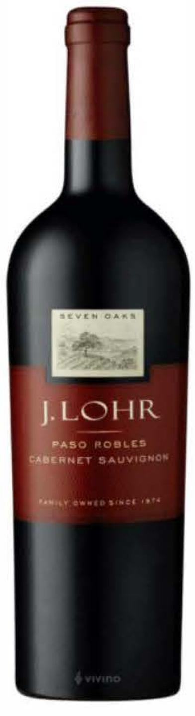
2018 J. LOHR, SEVEN OAKS CABERNET SAUVIGNON 15/50 PASO ROBLES

Ripe fruit aromas of black cherry and currant are accented by notes of toasted pastry and dark roast coffee from the authentic barrel bouquet.