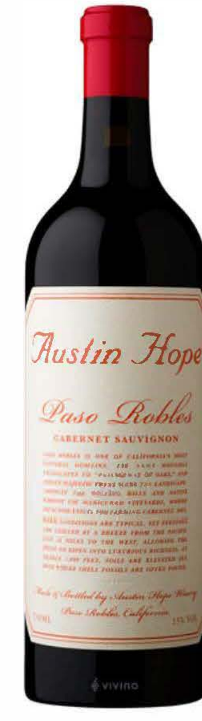
2019 AUSTIN HOPE CABERNET SAUVIGNON 120 PASO ROBLES

Blend of crème de cassis, hazelnut, cocoa, and blackberry preserve, with bold flavor.