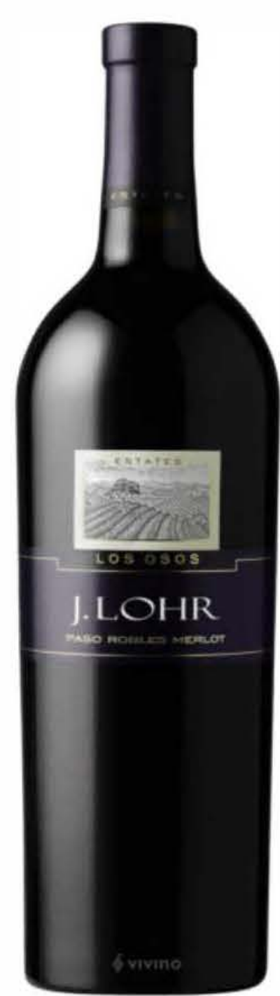
2018 J. LOHR, LOS OSOS MERLOT 13/45 PASO ROBLES

Aromas of blueberry, black cherry, anise, and black tea are accented by delicate notes of caramel and lilac.