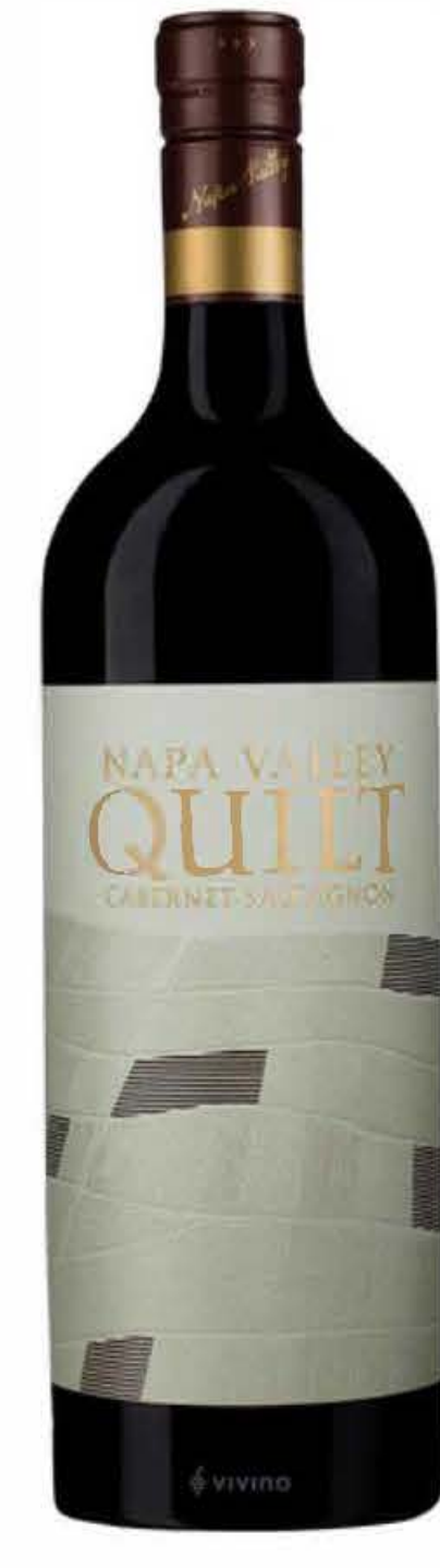
2018 QUILT CABERNET SAUVIGNON 100 NAPA V. ALLEY

Aromas of blackberry, cassis, fig, and mocha and notes of dark fruit and earthy tobacco threaded with nuances of spicy clove, mocha, and vanilla.