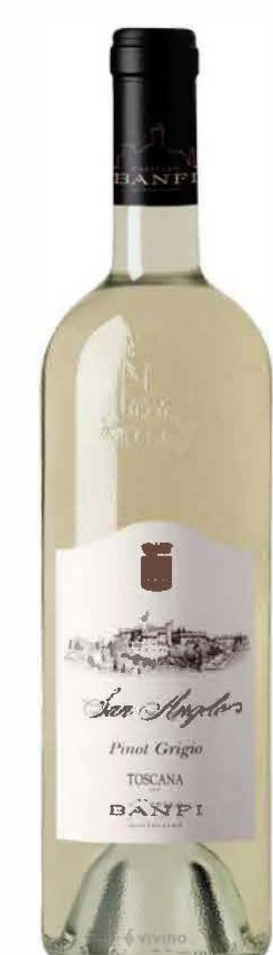
2019 BANFI, SAN ANGELO PINOT GRIGIO 15/55 ITALY TOSCANA

Aromas of ripe grapefruit, makrut lime and passionfruit on the nose, and juicy stone fruit characters melding together, underpinned by a subtle minerality.