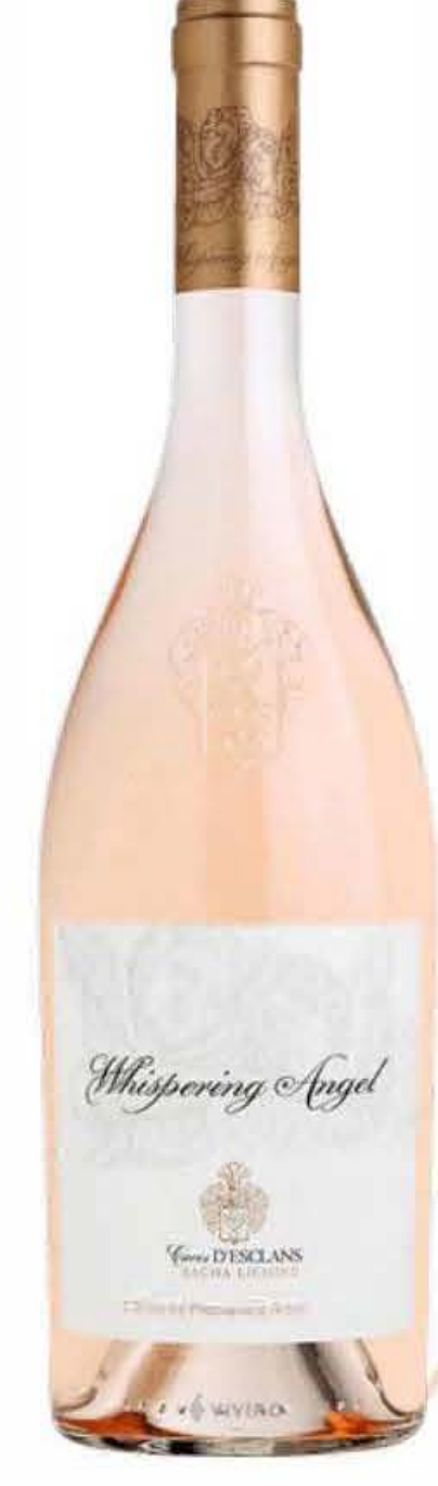
2019 WHISPERING ANGEL ROSE 17/60 FRANCE COTES DE PROVENCE

Ripe pear, honey, and citrus on the nose, opens lush and juicy with white peach, lemon curd and honeydew leading to an elegant finish of lemongrass and slate.