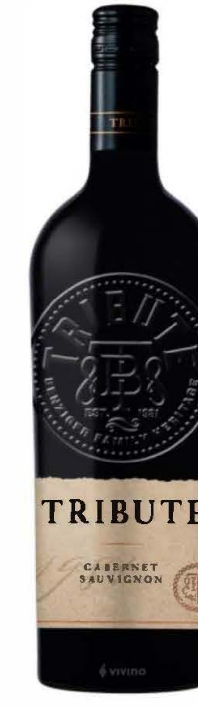
2018 TRIBUTE CABERNET SAUVIGNON 11/40 CALIFORNIA

Aromas of fresh black currants and cherries accompanied by subtle smoky notes and dried spices, with palate of juicy blackberry, ripe cherry, vanilla bean, and brown butter.