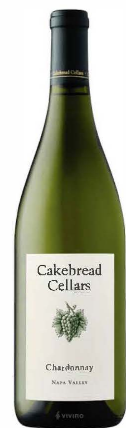
2018 CAKEBREAD CHARDONNAY 135 NAPA V. ALLEY

Mouth filling citrus fruit and palate cleansing with apple, citrus, vanilla, caramel lingering taste, with bright finish.