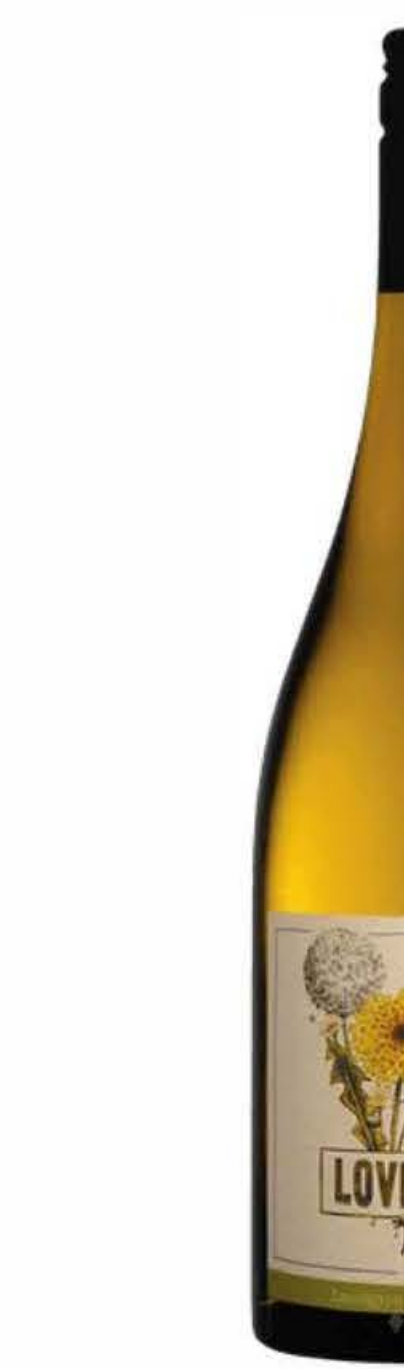
2019 LOVEBLOCK SAUVIGNON BLANC 22/80 NEW ZEALAND MARLBOROUGH

Aromas of honeysuckle and daffodil, grapefruit, sweet herbs, key lime complemented by the bright flavors of grapefruit, lime, lemongrass, and acacia barrels.