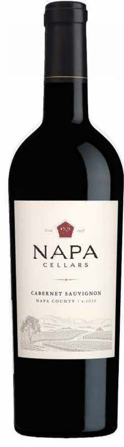
2019 NAPA CELLARS CABERNET SAUVIGNON 23/90 NAPA VALLEY

Ripe fruit aromas of black cherry and currant are accented by notes of toasted pastry and dark roast coffee from the authentic barrel bouquet.