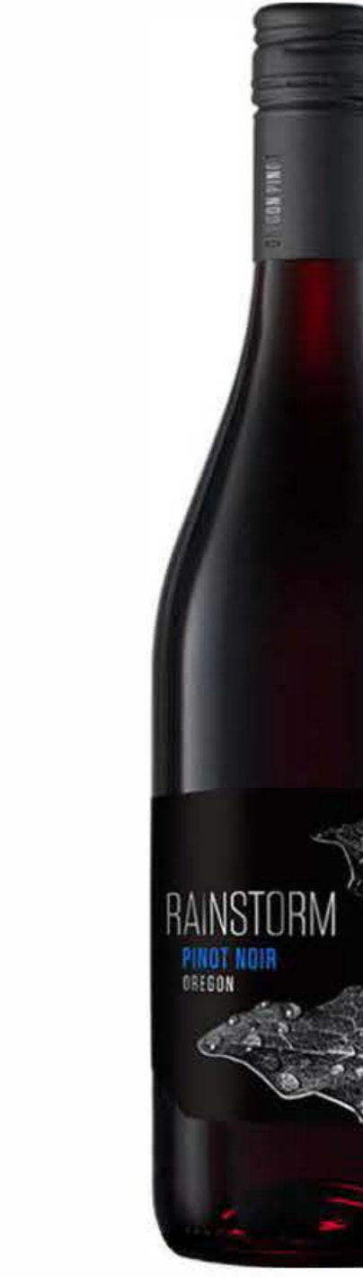
2017 RAINSTORM PINOT NOIR 17/60 WILL. AMETTEVALLEY

Aromas of strawberry, mocha, and vanilla along with toasty oak notes, and depth on the palate with boysenberry, blackberry, dark cherry, strawberry, and toasty mocha.