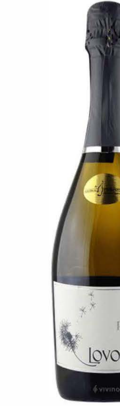
LOVO, PROSECCO MILLESIMATO 55 ITALY PROSECCO

Strength and silkiness, perfect balance with aromatic intensity and freshness with yellow and white fruits, vanilla, and toasty.