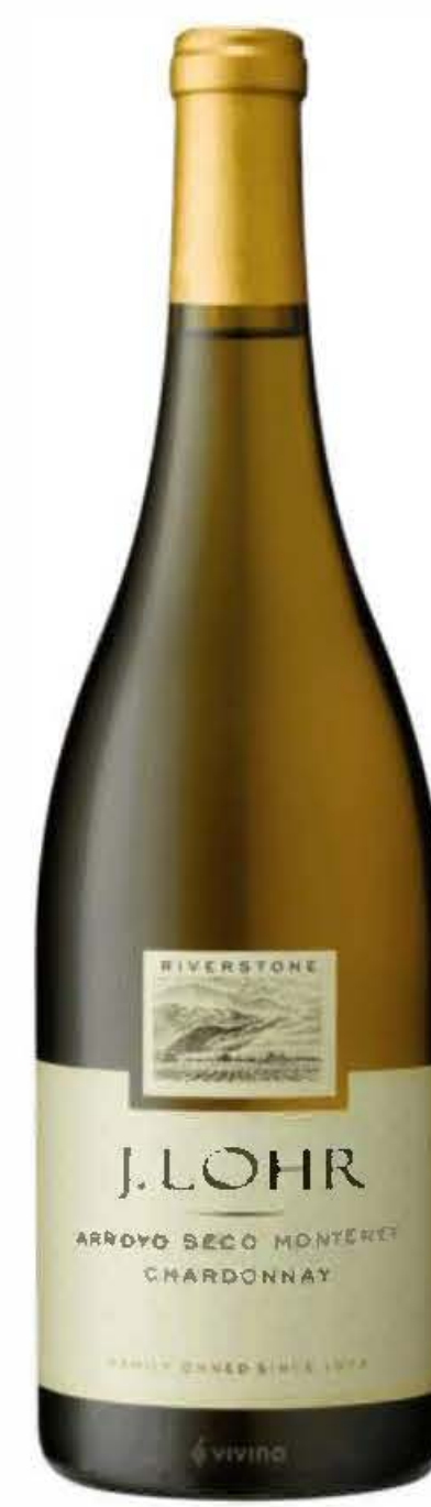
2018 J. LOHR, RIVERSTONE CHARDONNAY 13/45 ARROYO SECO

Enticing aromas of white peach, apricot, ripe orange, cocoa, complemented by the flavors of citrus cream and nectarine.