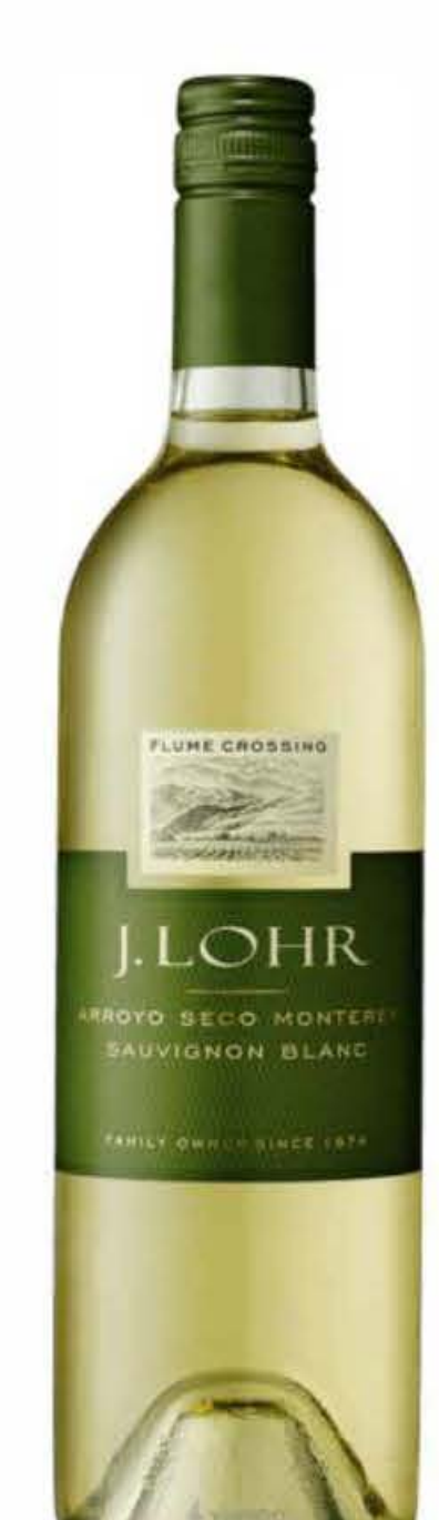
2019 J. LOHR, FLUME CROSSING SAUVIGNON BLANC 13/45 ARROYO SECO

Aromas of ripe golden apple, white peach with palate of apple and pear characters are balanced by fresh acidity, and the finish is clean, with appealing mineral notes.