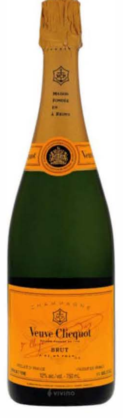
VUEVE CLICQUOT, BRUT CHAMPAGNE 180 FR. ANCE

Rose with lemons, cantaloupe, orange peel and peaches, with a hint of bitterness.