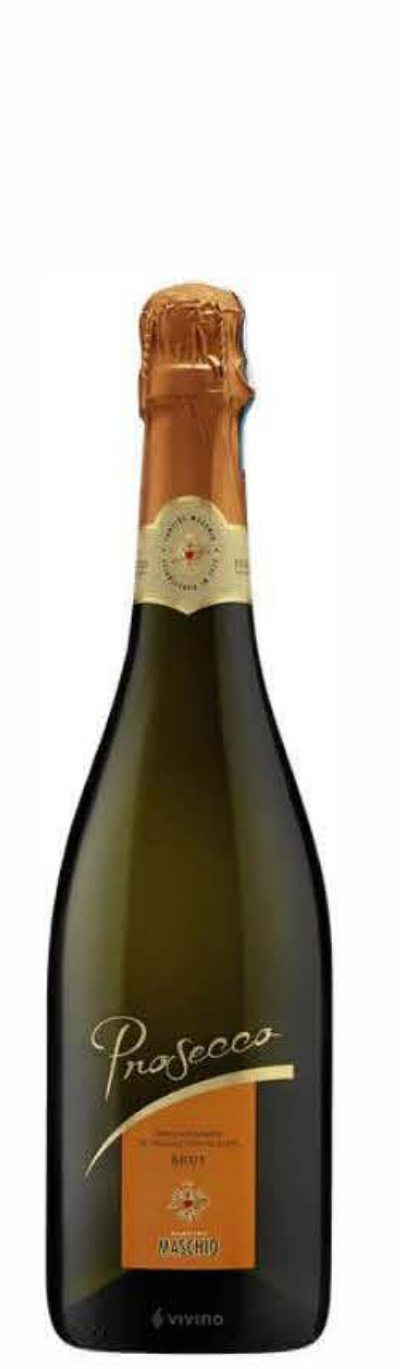
MASCHIO BRUT PROSECCO 10 [187ml bottle] ITALY PROSECCO

Light and harmonious, subtle mineral nuances in a dry after-taste with fruity, acacia flower aroma.