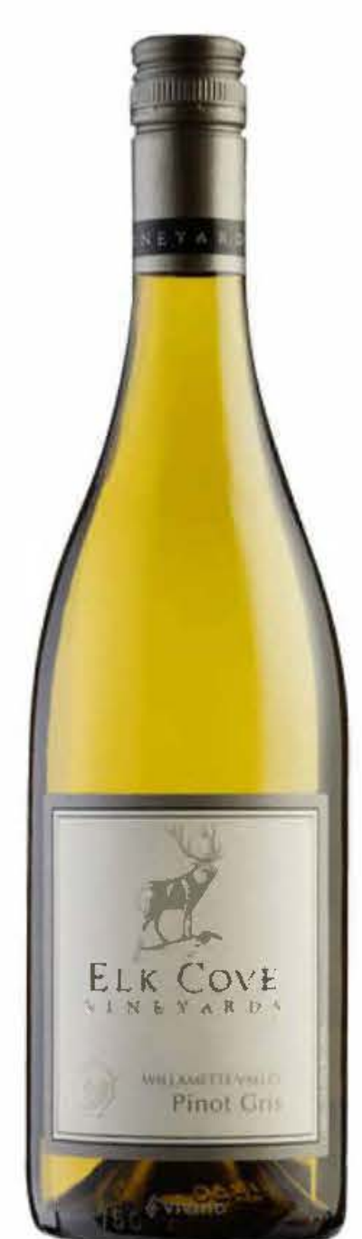
2018 ELK COVE PINOT GRIS 17/60 WILLAMETTE V. ALLEY

Fruity, crisp, and refreshing, with aromas of fresh bouquet, pear, peach, anise, and honey.