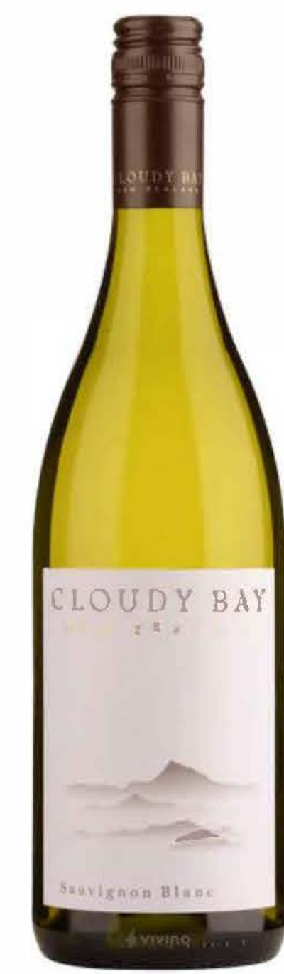
2020 CLOUDY BAY SAUVIGNON BLANC 120 NEW ZEALAND MARLBOROUGH

Elegant Sauvignon Blanc bouquet, pineapple, guava, and sweet meadow grass aromas, with palate of rounded and textured, with pineapple.