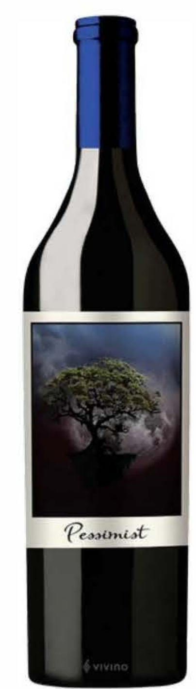
2018 DAOU, PESSIMIST RED BLEND 20/75 P. ASOROBLES

Varietal aromas of black plum and violet meld with the light barrel signature of baking spices and toasted pastry, lively and bright on the palate with red-fruit finish.