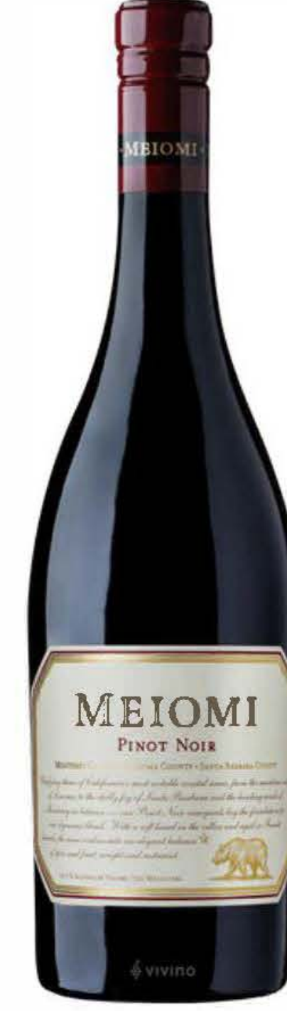
2019 MEIOMI PINOT NOIR 19/70 CENTRAL COAST

Plethora fruits of blueberry, boysenberry, plum, and strawberry with smoky notes of truffle and roasted coffee are accompanied by accents of floral consisting of lavender and lilac.